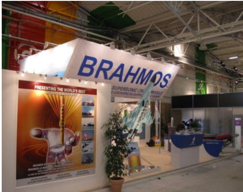
BRAHMOS STALL AT EURONAVAL EXHIBITION

France is also the venue for a number of prestigious defence exhibitions; Indian defence PSUs, DRDO and other companies have actively participated in Paris Air Show, Eurosatory and