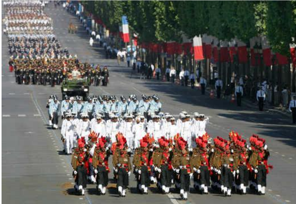
MARATHA LIGHT INFANTRY LEADING THE INDIAN ARMED FORCES CONTINGENT AT THE PARADE ON THE CHAMPS ELYSEES IN PARIS ON 14 JULY 2009

The High Committee on Defence Cooperation was established in 1998 as a result of an initiative by President Chirac during his visit to India in January 1998 to revive and revitalise the defence and strategic relationship with India.